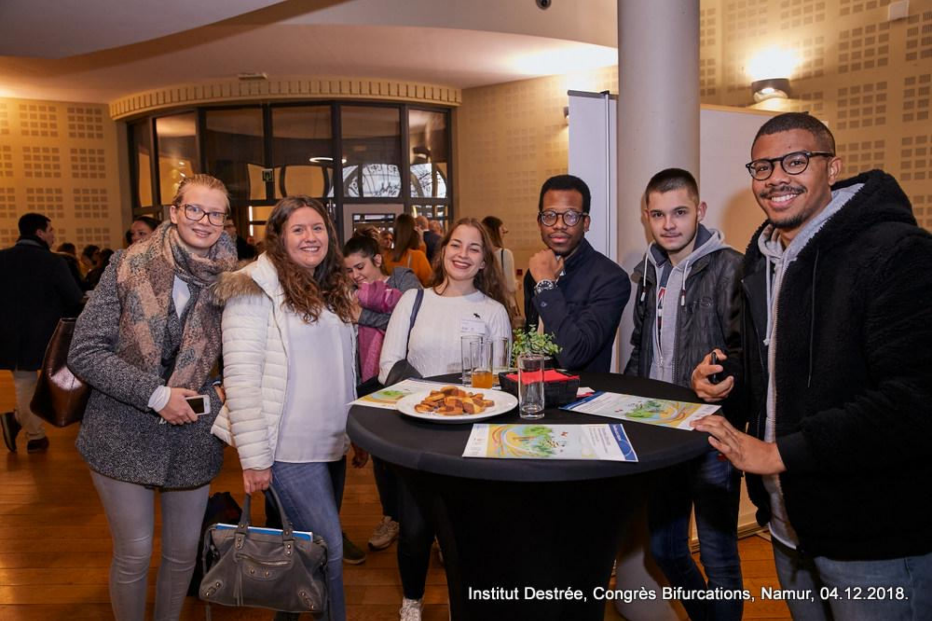
Institut Destrée, Congrès Bifurcations, Namur, 04.12.2018.