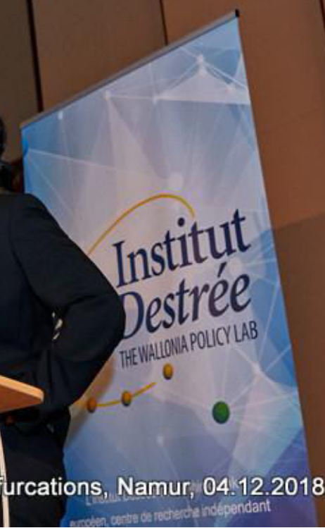
Institut Destrée, Congrès Bifurcations, Namur, 04.12.2018.