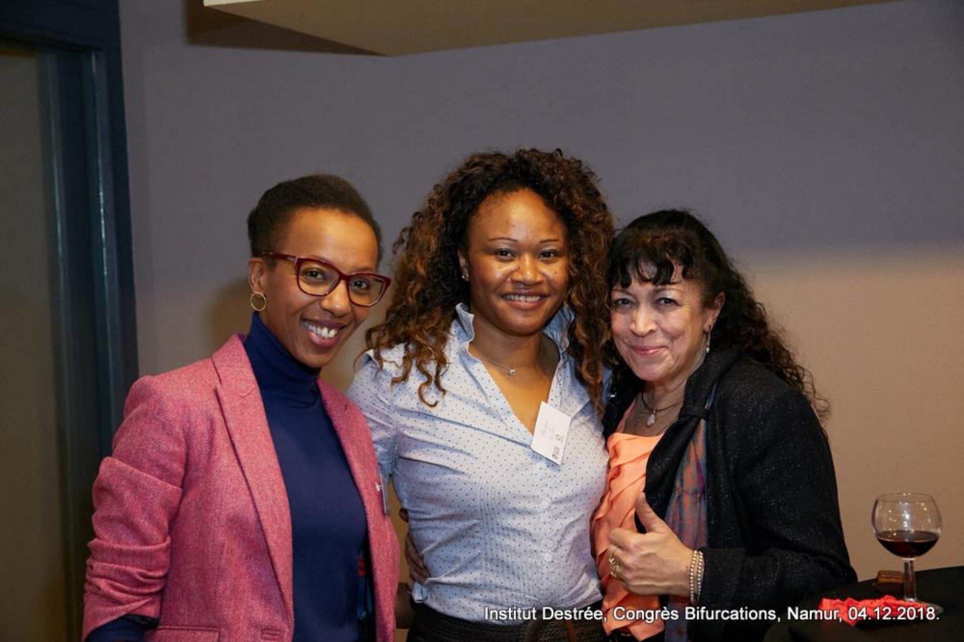
Institut Destrée, Congrès Bifurcations, Namur, 04.12.2018.