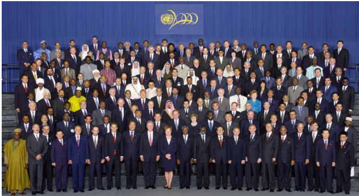
United Nations Photo by Terry Deglau/Eastman Kodak (UN Photo 204184C)

Source: http://www.un.org/av/photo/ga/caption.htm