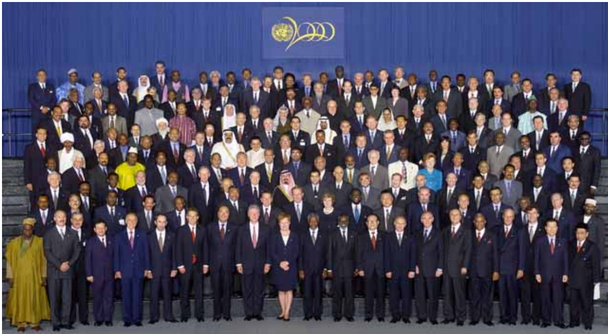
United Nations Photo by Terry Deglau/Eastman Kodak (UN Photo 204184C) See the Appendix for the Millennium Summit Group Photo-List of Participants